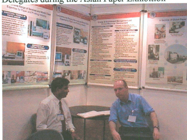
CPPRI Scientists with visitor from Thailand