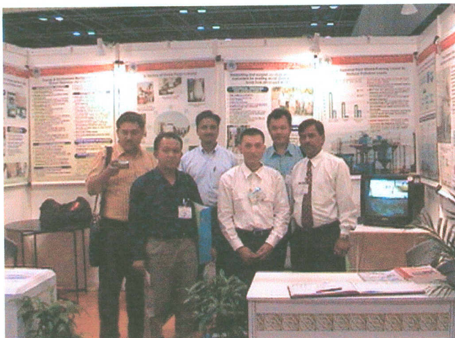
CPPRI Scientists with visitor from Thailand