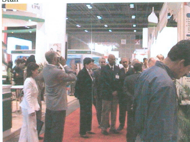
Delegates during the Asian Paper Exhibition