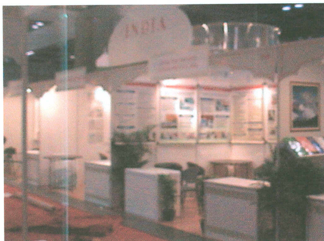
A view of the CPPRI Stall